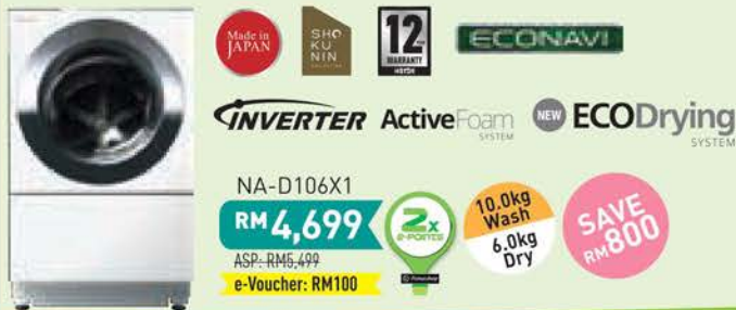
ECONAVI Inverter Washer Dryer