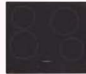
4 Zone Ceramic Hob