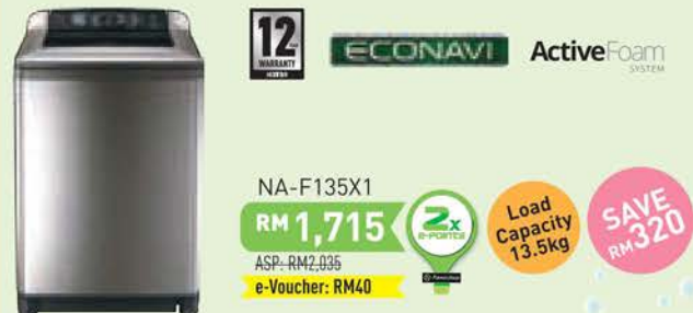
ECONAVI Top Load Washer