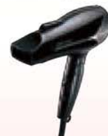
2000W Ionity Hair Dryer