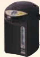
3.0L Thermo Pot