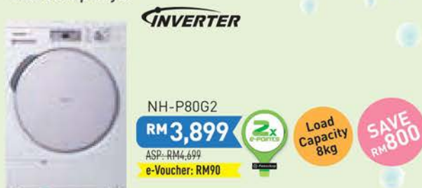
Heat Pump Dryer