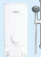
M Series (Non-Pump)