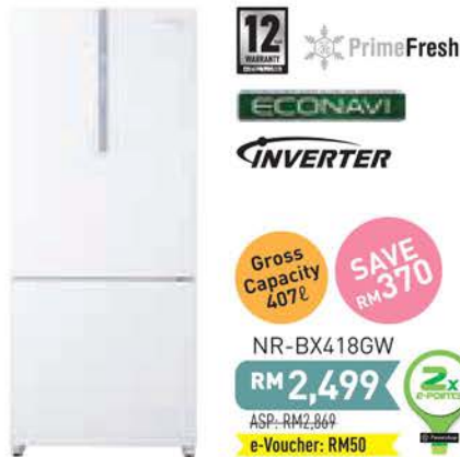
ECONAVI Inverter Bottom Freezer Glass Fridge (White)