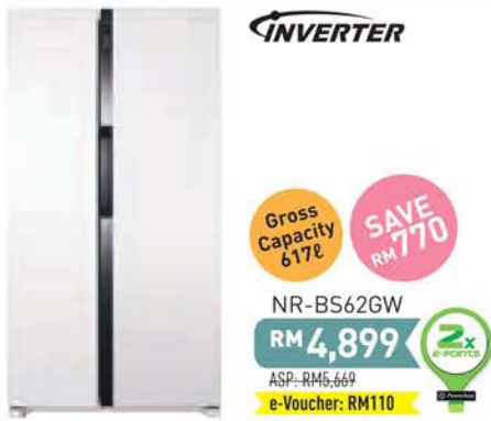
Inverter Side-by-Side Fridge