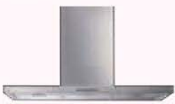
90cm Range Hood