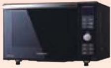
23L Double Heater Microwave Oven