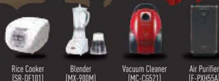
Rice Cooker (SR-DF101)