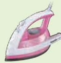
360° Quick Multi-Directional Steam Iron