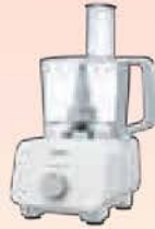
2.5L Food Processor