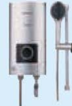
N Series (DC Pump)