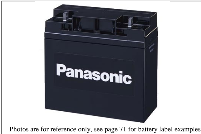
Photos are for reference only, see page 71 for battery label examples.

* This product adopts UL94HB-compliant resin as the material of the battery case. Product color is black. Optionally, type LC-VC1217P(a) which adopts flame-retardant resin complying with UL94V-0 is also available. Product color is gray.