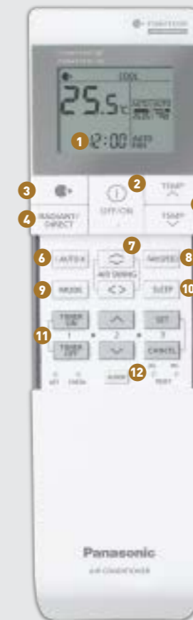
Wireless Applicable to ELITE INVERTER