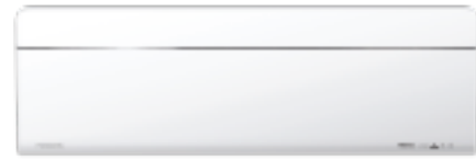
CS-VU9UKH-8 | CS-VU12UKH-8 | CS-VU18UKH-8