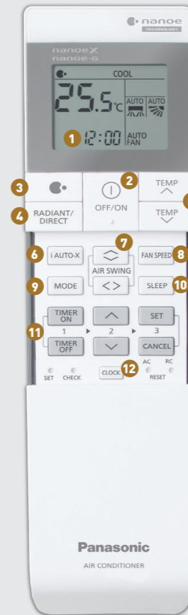
Wireless Applicable to ELITE INVERTER