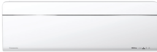
CS-VU9UKQ | CS-VU12UKQ | CS-VU18UKQ

WALL-MOUNTED : ELITE INVERTER Single-Split Type