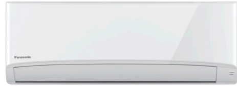
CS-PN9UKQ | CS-PN12UKQ