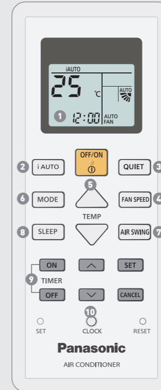
Wireless Applicable to STANDARD NON-INVERTER