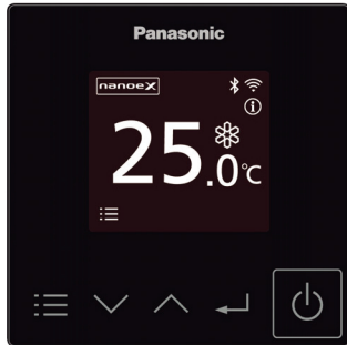
Dimensions H 86 x W 86 x D 25mm