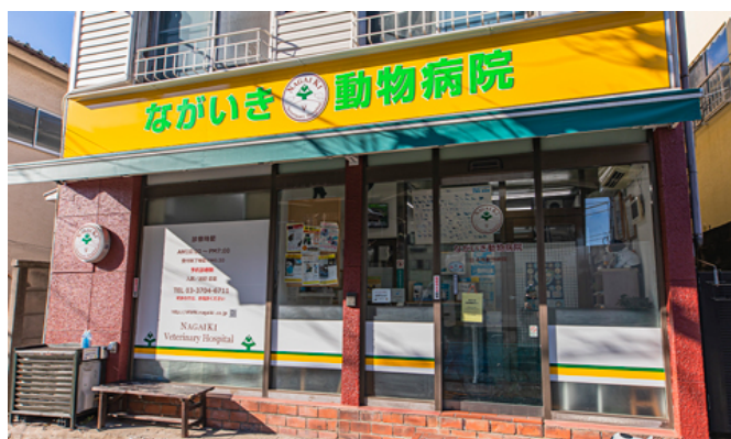
NAGAIKI Veterinary Hospital