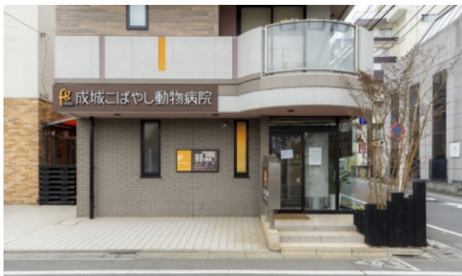
Seijo Kobayashi Veterinary Clinic

Seijo Kobayashi Veterinary Clinic follows the management philosophy of “fee-goo”, a popular contraction of the English phrase “feel good.” The clinic, which prides itself on showing a spirit of kindness to pets and their owners, offers a wide range of treatments and palliative care.