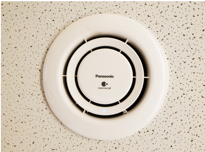
Neat installation of air-e ceiling mounted nanoe™ X generator.

The air-e ceiling mounted nanoe™ X generators are compact in size, offering ease of installation with a neat appearance for any environment.