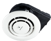
air-e ceiling mounted nanoe™ X generator (8 units)