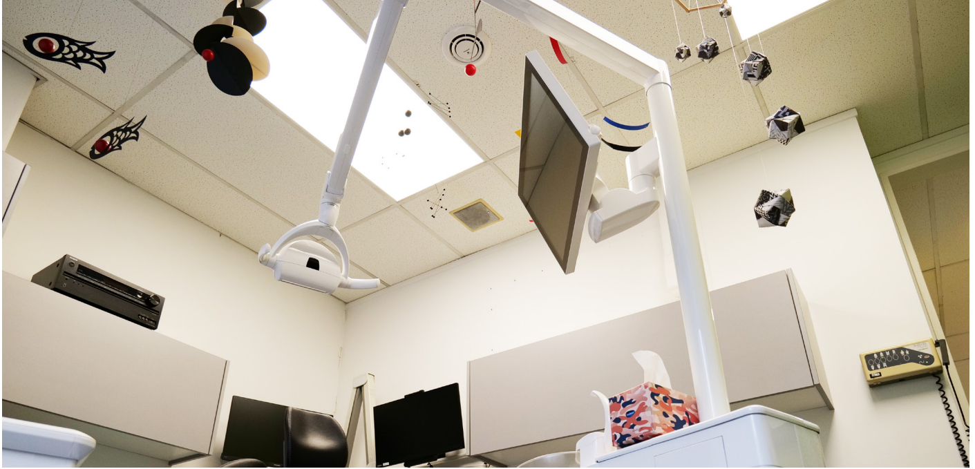
air-e ceiling mounted nanoe™ X generator installed in Queen Street Dental's treatment room.

Queen Street Dental has opted for Panasonic's patented air purification technology, nanoe™ X by installing 8 air-e ceiling mounted nanoe™ X generators to provide continuous clean indoor air in its premises.