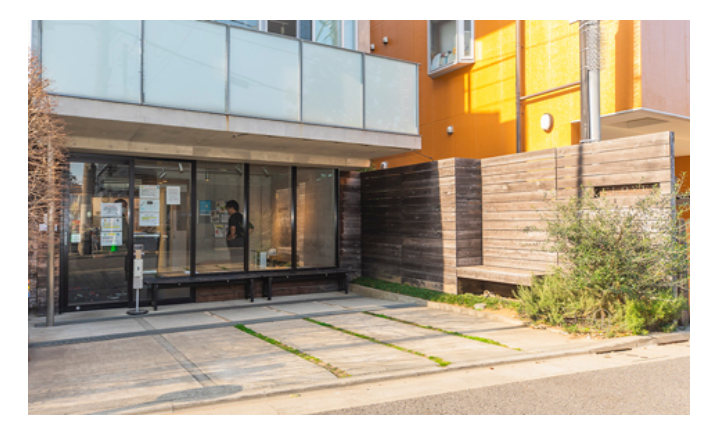
Clover Animal Hospital

Clover Animal Hospital hopes to be the first point of call for local pets' medical treatments. Since moving to Futakotamagawa 6 years ago, the hospital has provided optimal treatments tailored to each pet.