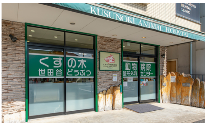
Kusunoki Animal Hospital

Kusunoki Animal Hospital offers a type of medical care in which the pets' owners can also participate. To make itself a more welcoming place, the animal hospital has created comfortable air environments for its visitors.