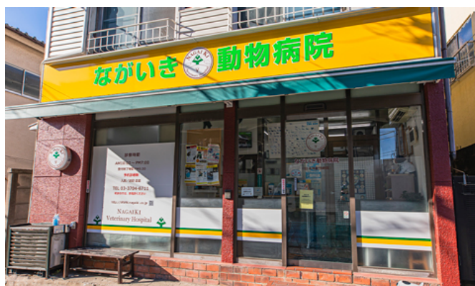
NAGAIKI Veterinary Hospital