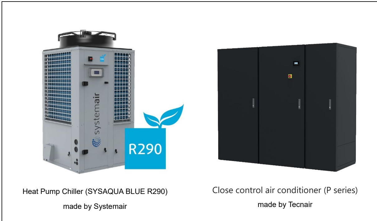
Heat Pump Chiller (SYSAQUA BLUE R290) made by Systemair