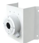
PM-YH0301-W+ PM-YZJ0601-W Corner Mount Bracket