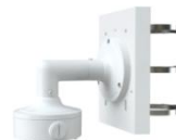
PM-YH0101B-W + PM-YZJ0406-W + PM-YZJ0501-W Pole mount bracket