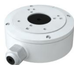
PM-YH0301-W Junction box