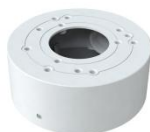
PM-YH0104-W Junction box