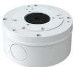
PM-YH0103-W Junction box