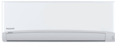
CS-U25TKR | CS-U35TKR