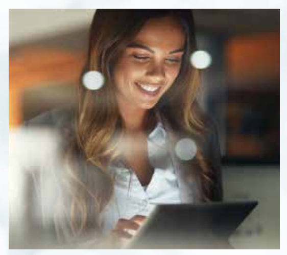
SMART Control Control, monitor & analyse up to 200 units in multiple locations from just one device.

Now Google Assistant and Amazon Alexa Compatible*.