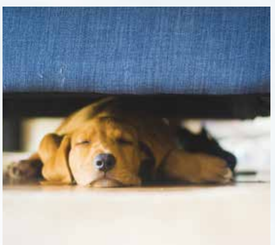
SMART Comfort Control your comfort 24 hours a day with remote AC access features, air purification functionality and much more.