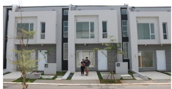
The customer and his wife took a picture in front of their dream home

PHDI has opened a new demo room that due to approach the concept of "Quality Air for Life" to customers in the SAVASA Marketing Gallery on February 2020. The concept of "Quality Air for Life" which consists of various solutions and technologies embedded in air conditioning, ventilation, and Panasonic air purifiers. Under the COVID-19 crisis, people's awareness become to more sensible for indoor air than before.