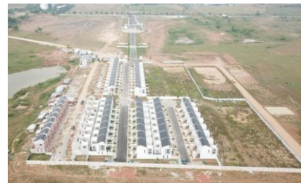
The construction site at SAVASA

The WPC (Wall Pre-cast Concrete) construction method unique to Panasonic, POWERTECH, is used to increase the safety of houses. This meets the anti-quake criteria required for shop and office buildings in Indonesia, thereby offering houses in which people can lead secure lives in quake-prone Indonesia.