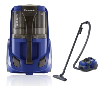
*Also available in Maroon Colour