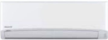
CS-U25TKR | CS-U35TKR