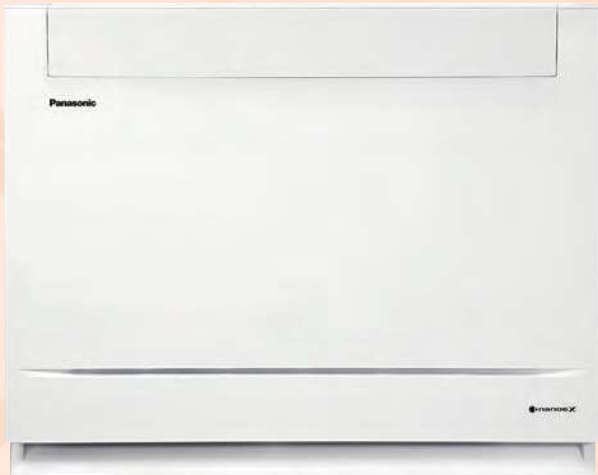
CS-Z25UFRAW CS-Z35UFRAW CS-Z50UFRAW