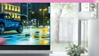
Filmmaker Mode With Intelligent Sensing

An alliance of electronics companies and the world's leading directors devised the Filmmaker Mode. With a single button-press you can preserve the movie's ideal colour, contrast, aspect ratio and frame rate by deactivating some of the TV's picture pre-sets.