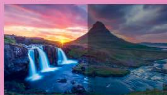
HEXA CHROMA DRIVE PRO

Now you're seeing truly rich colour. Thanks to an advanced processing technology called Hexa Chroma Drive that uses 6-Colour Reproduction, it manages colours by adding 3 complementary colours (CMY) to the 3 primary colour axes (RGB). Images are naturally beautiful. Panasonic TV invites you and your family to a new level of viewing pleasure.