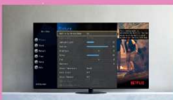
Netflix Calibrated Mode

Netflix series and films are made to exacting standards, so that they can look stunning on a big screen. Netflix Calibrated Mode means your TV gets the best from their shows, delivering them to your home as their makers intended.