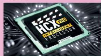
HCX PRO Intelligent Processor

Working together with Hollywood colourists, Panasonic's passion for films combined with advanced technology has produced the HCX PRO Intelligent Processor. This startlingly powerful chip produces unrivalled cinematic quality for home viewing.