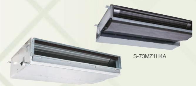
S-22MZ1H4A/ S-28MZ1H4A/ S-36MZ1H4A S-45MZ1H4A/ S-56MZ1H4A/ S-60MZ1H4A

The ultra slim Z1 type is one of the leading products of its type in the industry. With a height of only 200 mm, it provides greater flexibility and adaptability for various applications. In addition, high efficiency and extreme low noise level make it highly suitable for hotels and small offices.