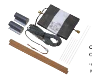
CZ-P56SVK2 (for 22 - 56 type) CZ-P160SVK2 (for 73* - 106 type)

To reduce noise level of expansion valve. (Optional accessory)