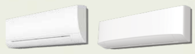
S-22MK2E5A / S-28MK2E5A / S-36MK2E5A S-45MK2E5A / S-56MK2E5A / S-73MK2E5A / S-106MK2E5A