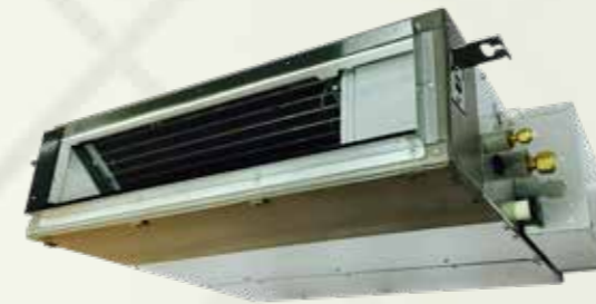
S-22MM1E5A / S-28MM1E5A / S-36MM1E5A S-45MM1E5A / S-56MM1E5A

The ultra slim M1 type is one of the leading products of its type in the industry. With a height of only 200 mm, it provides greater flexibility and adaptability for various applications. In addition, high efficiency and extreme low noise level make it highly suitable for hotels and small offices.