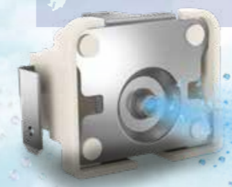
nanoe™ X device

Unique nanoe™ X module casing releases 48 trillion hydroxyl radical [OH radical] per second.