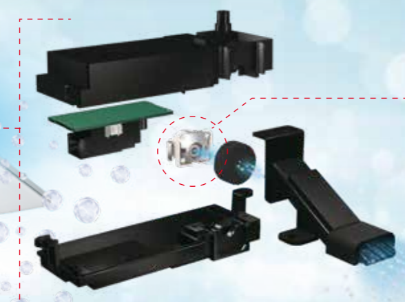
nanoe™ X module

Electrodes of nanoe™ X devices are produced with the support of craftsmen in Japan that has advanced expertise on processing ultra-small parts of titanium glass frames although titanium is very strong material and difficult to process.