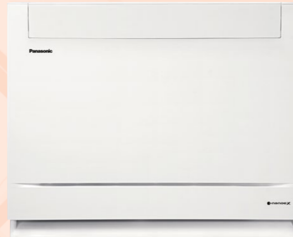
CS-Z25UFRAW CS-Z35UFRAW CS-Z50UFRAW

nanoe™ X Generator Mark1 nanoe™ X as a standard