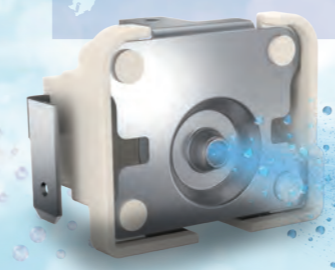
nanoe™ X device

Unique nanoe™ X module casing releases 48 trillion hydroxyl radical (OH radical) per second.