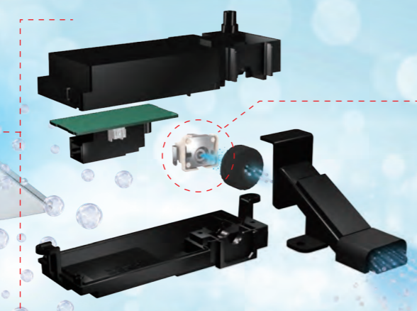
nanoe™ X module

Electrodes of nanoe™ X devices are produced with the support of craftsmen in Japan that has advanced expertise on processing ultra-small parts of titanium glass frames although titanium is very strong material and difficult to process.